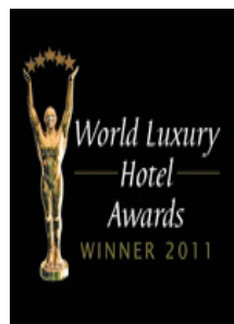
WORLD LUXURY – BEST LUXURY SPA RESORT