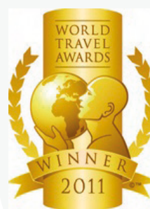
WTA – World's Leading Fully Integrated Resort