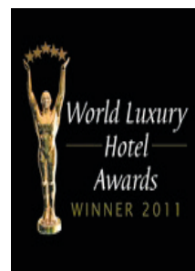
WORLD LUXURY – BEST LUXURY GOLF RESORT