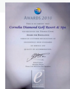
MARK for EXCELLENCE