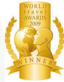
WTA – Europe's Leading Spa Resort