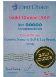
FIRST CHOICE GOLD CHOICE