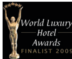
WORLD LUXURY – LUXURY GOLF RESORT