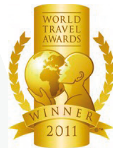
WTA – Europe's Leading Resort Villa