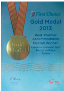
FIRST CHOICE – GOLD CHOICE