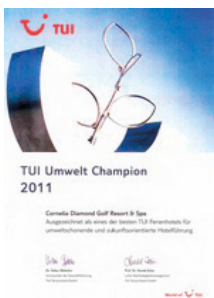
TUI – UMWELT CHAMPION