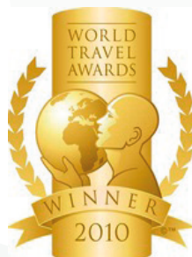
WTA – Europe's Leading Spa Resort