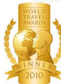
WTA – World's Leading All Inclusive Golf Resort