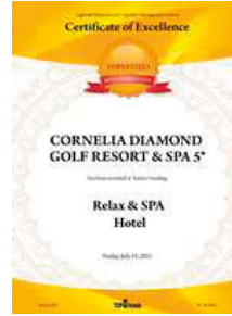
TOPHOTELS – Turkey's Leading Relax & SPA