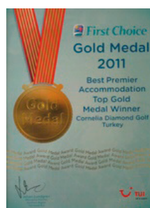
FIRST CHOICE – GOLD MEDAL