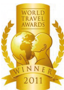
WTA – Europe's Leading Luxury Resort