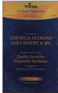
TOPHOTELS – AWARD for EXCELLENCE