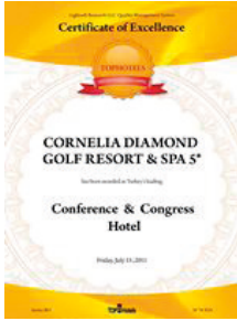
TOPHOTELS – Turkey's Leading Conference

2024 SUMMER SEASON CONCEPT (05 MAY- 15 OCTOBER)