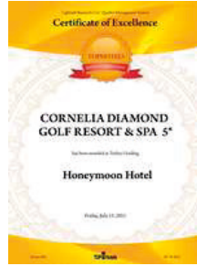
TOPHOTELS – Turkey's Leading Honeymoon