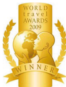
WTA – Turkey's Leading Spa Resort