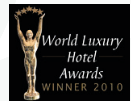
WORLD LUXURY – BEST LUXURY GOLF RESORT