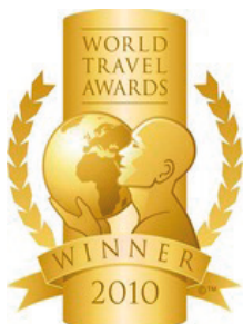
WTA – Europe's Leading Luxury Resort