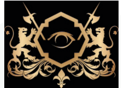
EYE AWARD – EUROPE'S BEST SPORT HOTEL