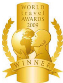
WTA – Europe's Leading Golf Resort