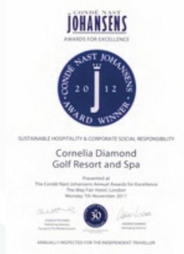
CONDE NAST JOHANSENS – WINNER (Sustainable Hospitality and Corporate Social Responsibility 2012)