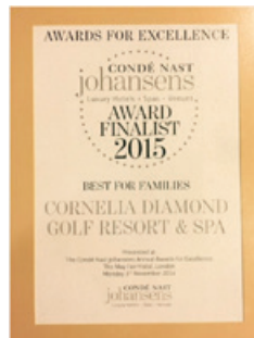
CONDE NAST JOHANSENS