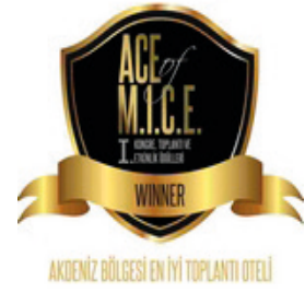
ACE of MICE – Best Congress Hotel in Antalya