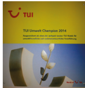
TUI – UMWELT CHAMPION