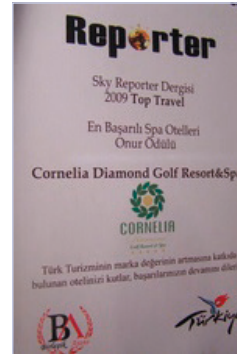
REPORTER MAG. – BEST SPA HOTEL