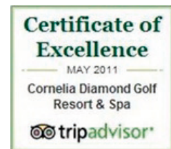
TRIP ADVISOR – CERTIFICATE OF EXCELLENCE